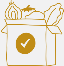
FOOD SAFETY CERTIFICATION P. 60